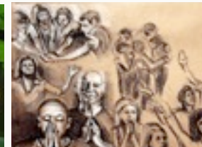
Expressions of the patterns of Jesus Christ in the life of people.