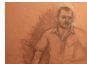
An art model off rhythm that was addicted to heroine.

With as many seismic changes in our world today, it is becoming increasingly clear the profound sin-sickness that permeates our planet. We have observed that rhythms repeating around this pervasive sickness sow seeds of destruction, slowly growing "fruit" that leads to death, physically and spiritually. In the city of Chicago, we have observed these rhythms manifested in gang-violence, addiction (especially drugs, overeating and work) and brokenness in families and government systems.