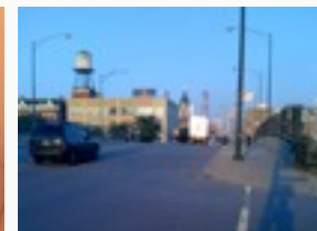
Chicago Avenue near I-90/I-94.