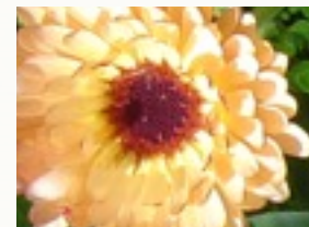
A flower with the patterns repeating around the center.

The Good News is that people are acutely aware of this chasm that separates themselves from God, and all across the globe, men and women desire to find God – even if they don't know where to look. Even with 5 out of 6 Americans not a part of the Church, there is a profound desperation for God and his lifestyle of intimacy, wholeness and salvation from the sickness of sin. God's rhythms bring life to people in cities; we join God in modeling rhythms of life to people in our context, and we would like to invite you to join us in this as well.